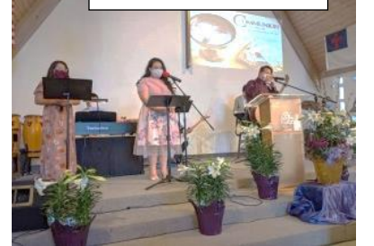
Pab Saib Nkauj thiab Pab Kaw Suab thiab Yeesduab