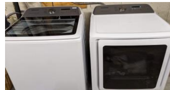
Cav ntxhua thiab ziab ristsho tshiab (New washer & Dryer)