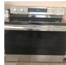
Qhovcub Tshiab (New Stove)