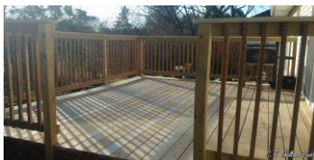
Samthiaj tshiab (new deck)